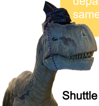
Shuttle bus stop (C3)

caution! Buses bound for "Weird Hotel Maihama Tokyo Bay" also depart from the same bus stop.