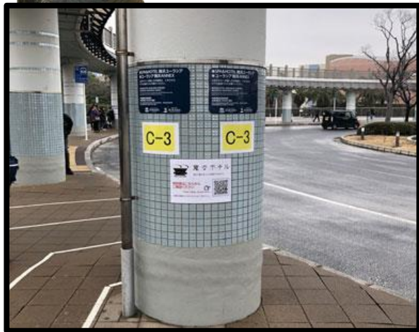
Shuttle bus stop (C3)

caution! Buses bound for "Weird Hotel Maihama Tokyo Bay" also depart from the same bus stop.